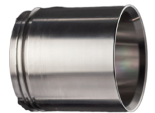
DRAFT INDUCER TUBE

NOTE: Run your probes into your cooker at the top of your access door or under the lid.