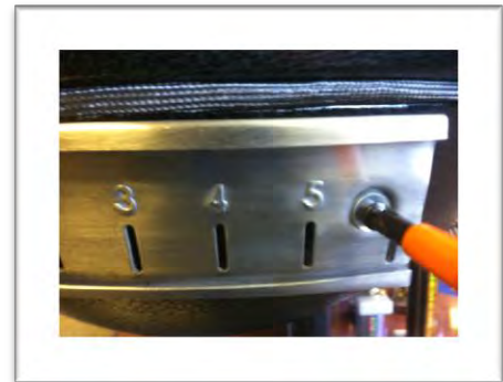
Step 4: Screw damper track back on