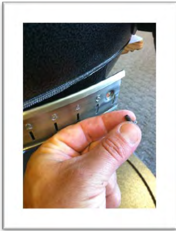
Step 1: Remove right screw from lower damper track