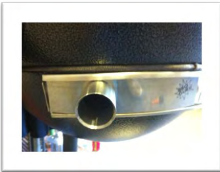
Step 3: Slide adaptor all the way over to the left